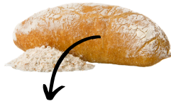
Whole grain loaf